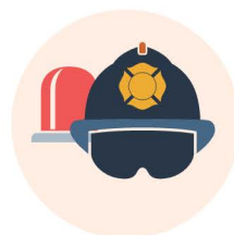
EMERGENCY SERVICES AND FIRE DEPARTMENTS