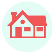
HOUSING ASSISTANCE PROGRAMS